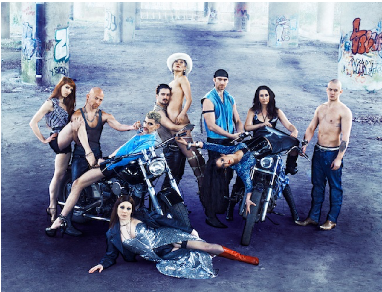
hoto: 100% Halal